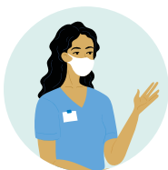
TO HOPITAL TO