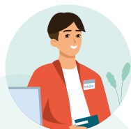
NDER NOKKU BADATE'EDO DEPISTAGE WALLA NDER SUUDU SAFRIRDU