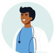
TO NOKKU DOCTOORAM O